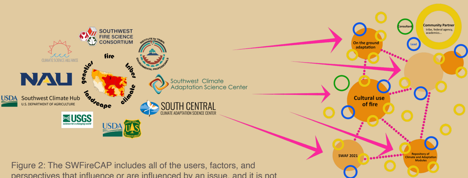
Figure 2: The SWFireCAP includes all of the users, factors, and perspectives that influence or are influenced by an issue, and it is not limited to just the members of the partnership.

The Southwest Fire and Climate Adaptation Partnership (SWFireCAP) is an open and inclusive group of partners with a shared vision for working together to advance fire and climate adaptation in the southwestern U.S. We believe that the monumental task of effective climate adaptation requires cross-organization collaboration and leveraging of people, time, resources, and funding. Initiated by the Southwest Climate Adaptation Science Center and the Southwest Fire Science Consortium, the SWFireCAP now has several partner organizations and is open to anyone interested in the intersection of climate change and fire in the Southwest.